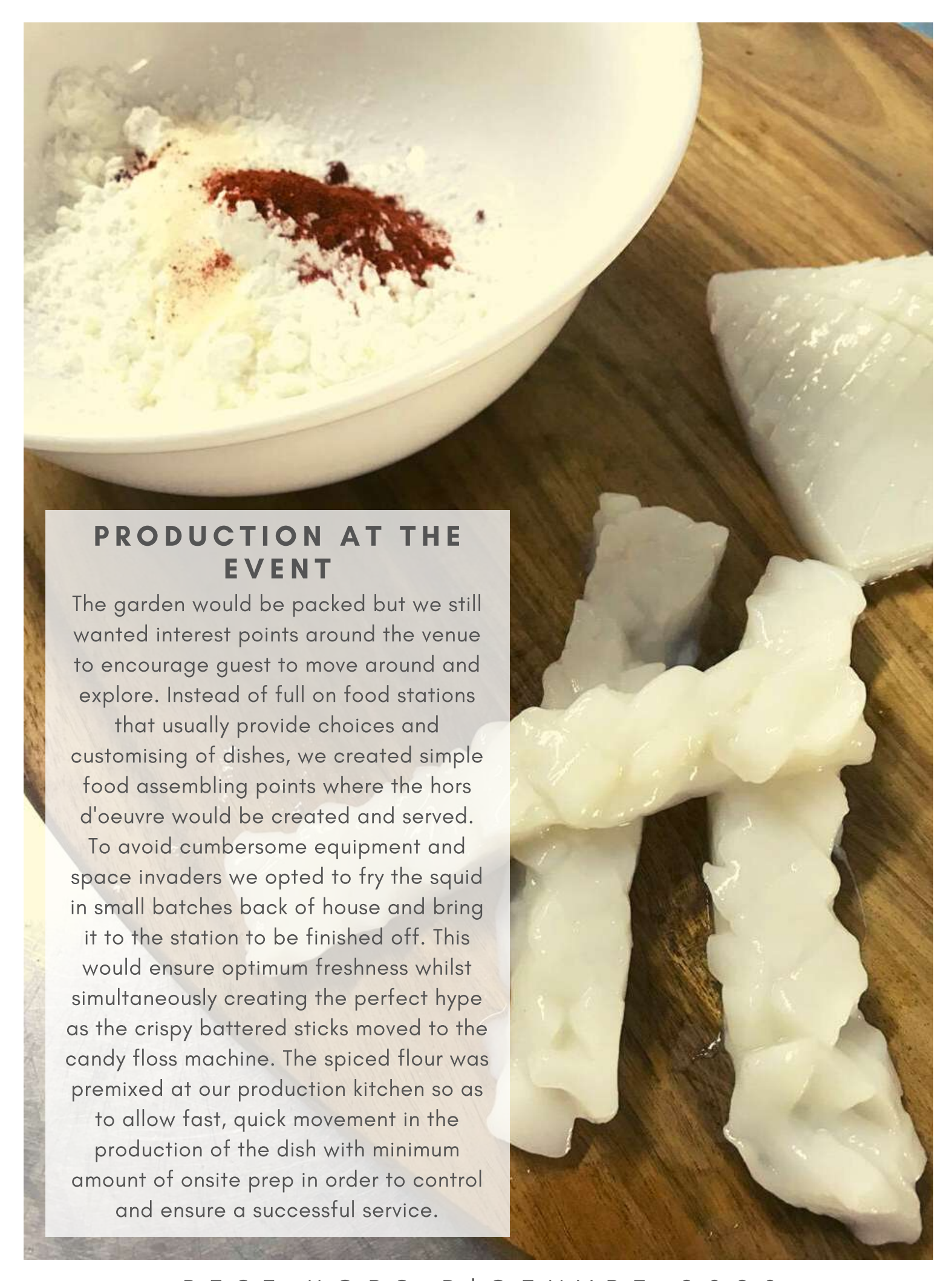
BEST HORS D'OEUVRE 2020 candyfloss squid